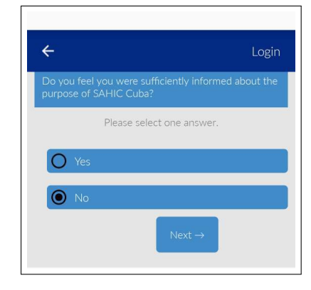
Fig. 4. Example screenshots collected by TestFairy. Left: Contact info. Center: Messaging another user. Right: Responses to a survey.

code does not guarantee it will ever be executed. To address this, we used dynamic analysis to filter out false positives. However, this does not address false negatives (where media API calls are reachable, but our automated interaction tool does not trigger them).