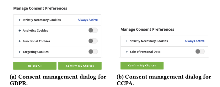
Figure 1: OneTrust's consent management dialog for GDPR and CCPA.

the first and third party resources. In case of GDPR, CMPs should ensure that only strictly necessary cookies are shared and consent is obtained before non-essential cookies, such as for advertising and analytics, are shared. In case of CCPA, CMPs should ensure that they provide controls to users to opt-out to sell their personal information.