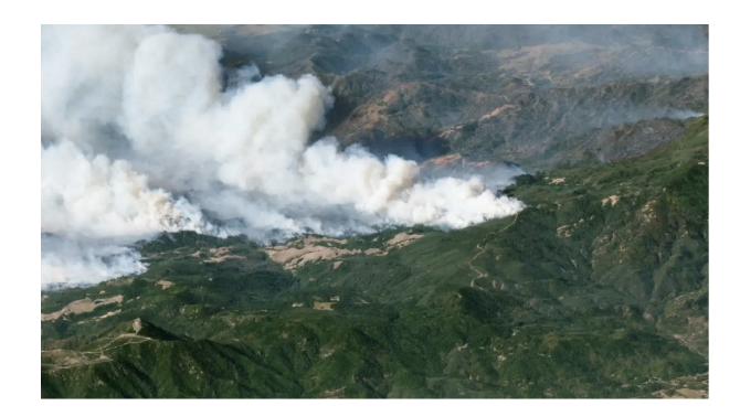
Figure 2: Example of a 60^{\circ} off-nadir satellite image from Planet Labs [33]

Earth provides the public with free, undated, high-resolution overhead images of most locations on Earth. Google Earth Pro, with its timeslider function, offers more historical satellite imagery, yet it still is typically only available at time intervals of one year apart or longer and thus is less of an individual privacy threat than purchasing commercial satellite images at a high temporal resolution.