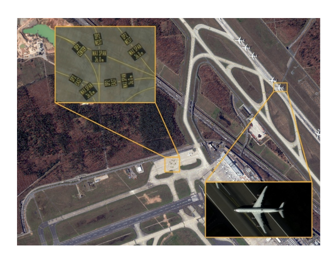
Figure 1: Example of 15cm resolution satellite image from Maxar [23]

Spatial and Temporal Resolution. Spatial resolution is the smallest dimension on the Earth's surface represented by one pixel in an image, e.g., a 3m spatial resolution means that one pixel in the captured satellite image represents a 3 x 3m square of the Earth's surface. Temporal resolution is the frequency at which images are